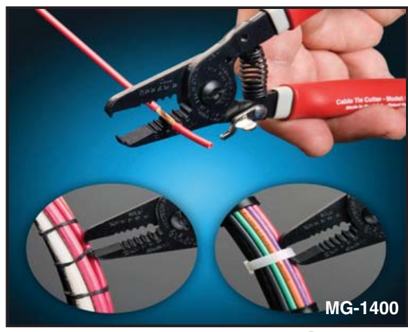
Patent # 8,365,41