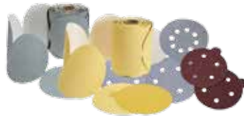
PSA and HOOK & LOOP DISCS