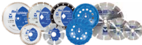
BLUE LIGHTNING™ and SkillPro™ DIAMOND BLADES