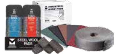
NON-WOVEN HAND PADS and STEEL WOOL