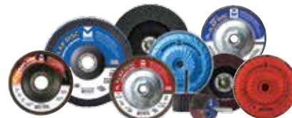
FLAP DISCS and FLAP WHEELS