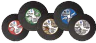
TYPE 1 CUT-OFF WHEELS