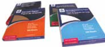
9 X 11 SHEETS