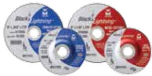
BLACK LIGHTNING® CUT-OFF WHEELS