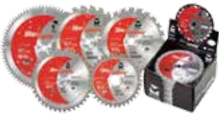
SILVER LIGHTNING™ CARBIDE BLADES