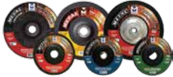
DEPRESSED CENTER GRINDING WHEELS