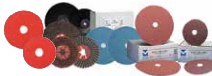
FIBRE and SEMI-FLEXIBLE DISCS