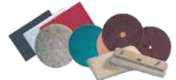
FLOOR MAINTENANCE PRODUCTS