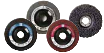
SURFACE PREP WHEELS and COATING REMOVAL DISCS