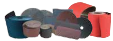
FLOOR ROLLS, BELTS and DISCS